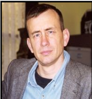
Lt. Col. Dave Grossman