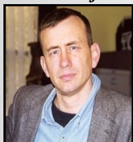
Lt. Col. Dave Grossman