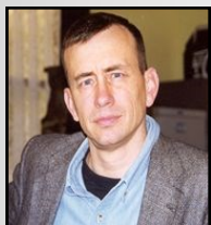
Lt. Col. Dave Grossman