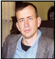
Lt. Col. Dave Grossman